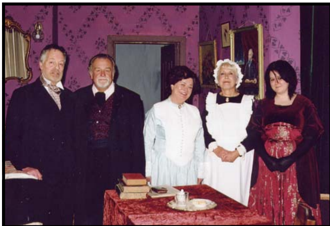
There Is Little To Choose Between The Finalists on BBC1's Strictly Stood Standing