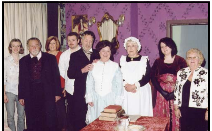
While Over On Channel 4, There Is A Palpable Air Of Tension Among The Housemates In Edwardian Big Brother