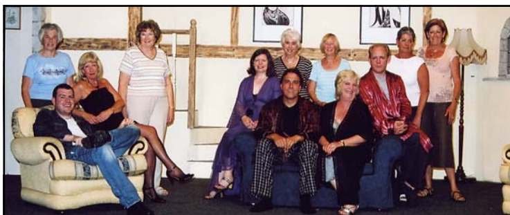
What It Would Like If You Were Inside The TV While The Entire Cast And Crew Were Watching Deal Or No Deal On A Wet Wednesday Afternoon