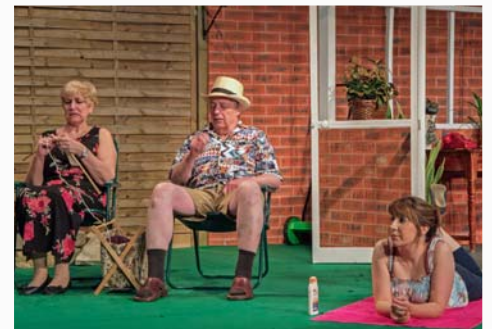
Photos From The Set Of Time And Time Again