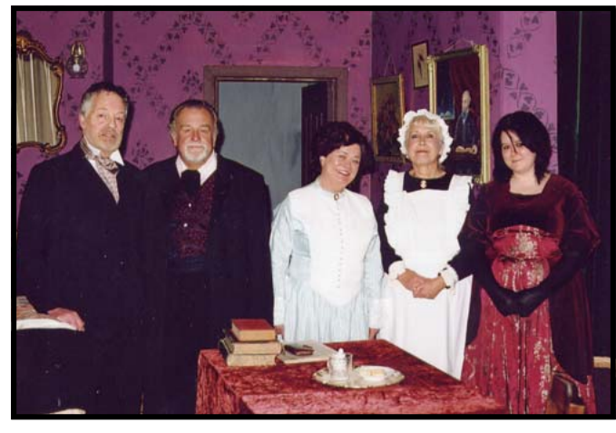
There Is Little To Choose Between The Finalists on BBC1's Strictly Stood Standing