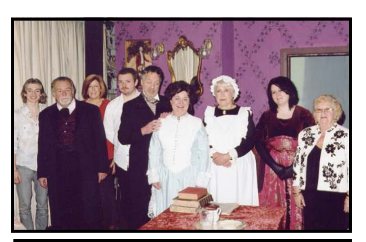
While Over On Channel 4, There Is A Palpable Air Of Tension Among The Housemates In Edwardian Big Brother