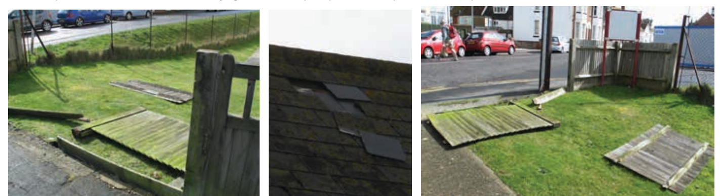
the fencing and roof damage at the Little Theatre in the aftermath of the recent gales.

The recent storms which rampaged across the country have unfortunately also taken their toll on the Little Theatre as our fencing, admittedly already not in the first flush of youth, received a severe battering over the Easter weekend and redistributed itself along parts of Steyne Road. And some of the roof slates went on a small provincial tour as well. So for the time being we have acquired a small unscheduled skylight and an open plan front apron. More expense for our Treasurer to tackle.