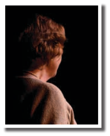
Seaford Little Theatre Newsletter