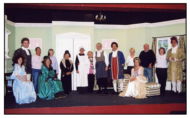
Seaford Little Theatre's Team Entry For The Historical Gurning Championships