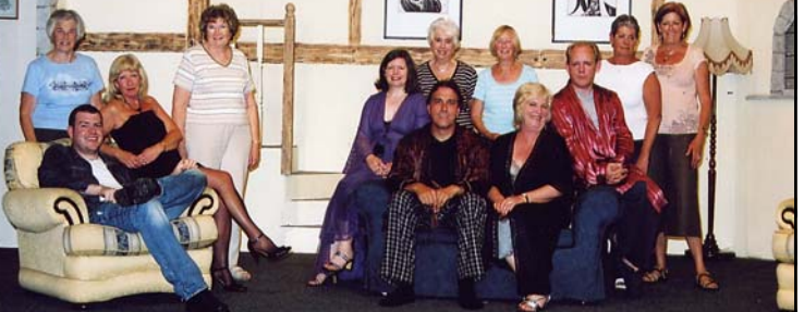
What It Would Like If You Were Inside The TV While The Entire Cast And Crew Were Watching Deal Or No Deal On A Wet Wednesday Afternoon