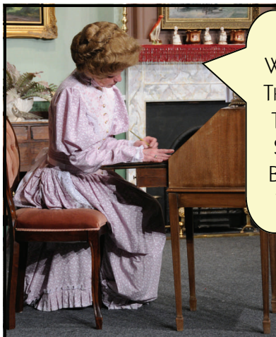
Photos From The Set Of The Day After The Fair

♪ OHHHH, I WENT DOWN TO THE SUPERMARKET TO GET MYSELF SOME CHOPIN, BUT FORGOT TO TAKE MY LISTZ ♪