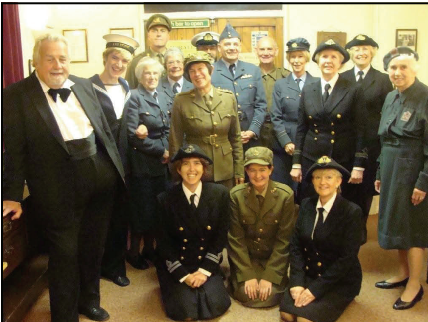
And Finally A Group Shot Of The Cast From The Seaford Live! Show 70 Year's On - An Evening Of World War II Nostalgia , Which Might Have Left Poor Adolf Wondering How He Could Have Got It All So Wrong