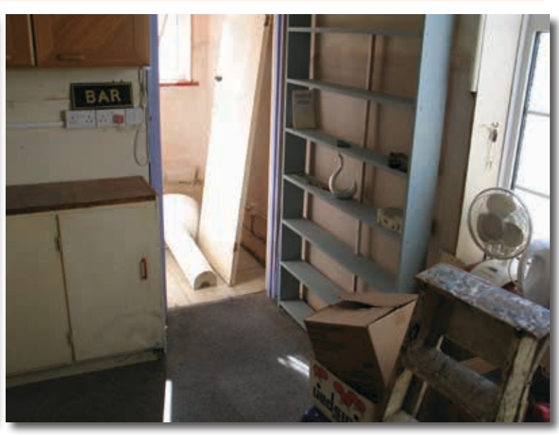
The new side doors and steps